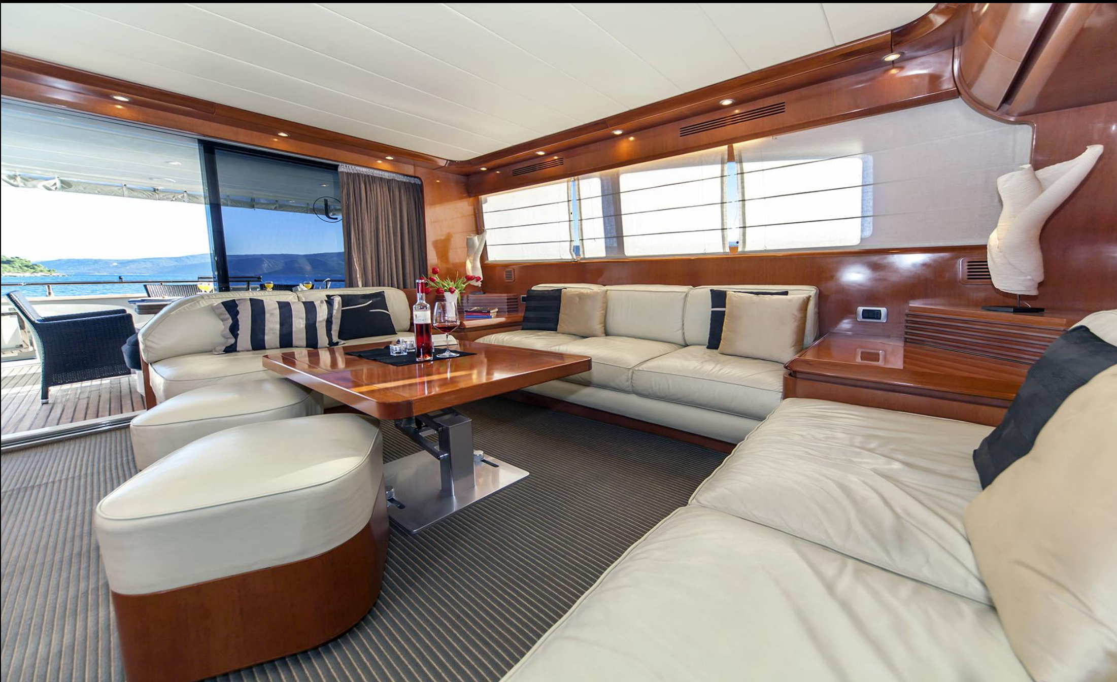
NICE COMFORTABLE LIGHT SALOON