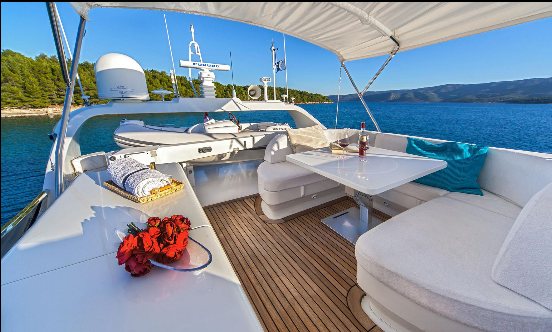
FLYBRIDGE TABLE CONVERTIBLE INTO SUNPAD