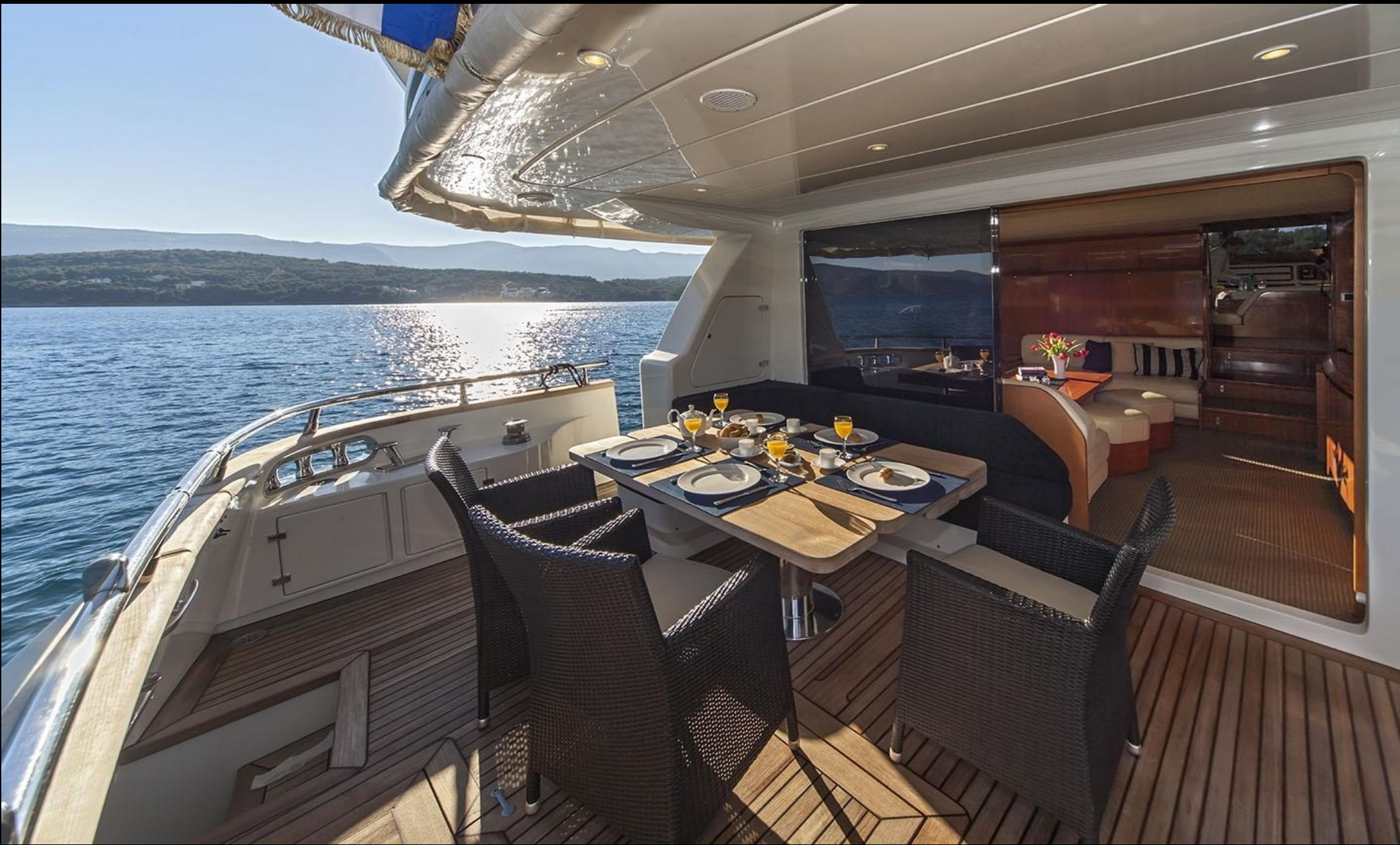
STERN LARGE DINING AREA