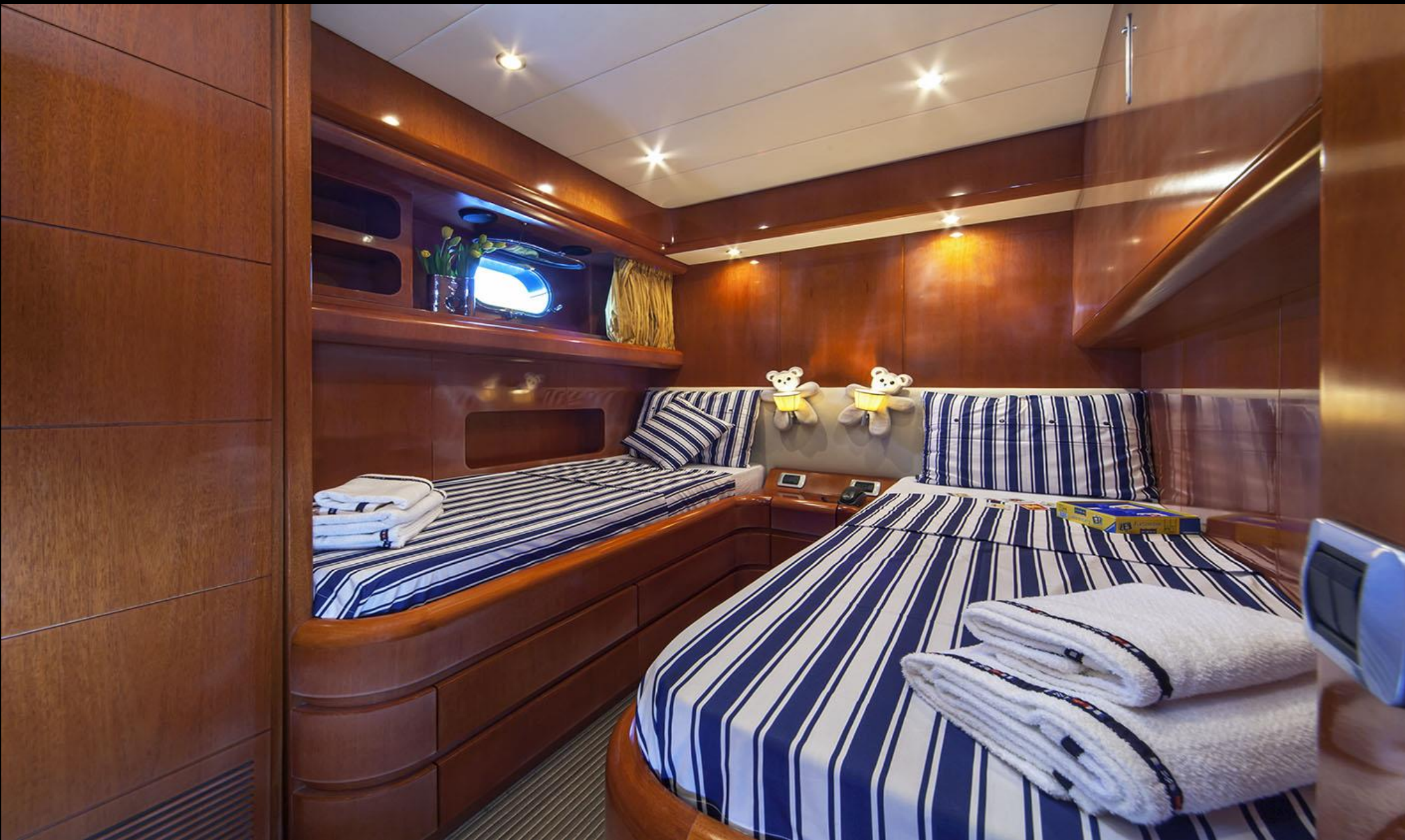
TWIN CABIN CONVERTIBLE INTO DOUBLE WITH ADD PULLMAN BED (UP TO 3 BERTHS)