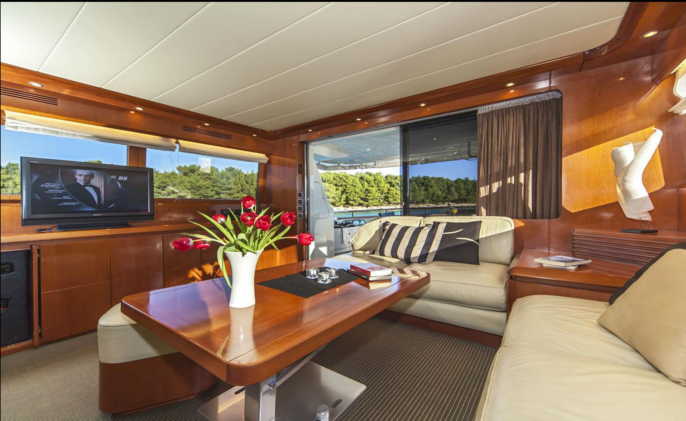
VIEW FROM SALOON