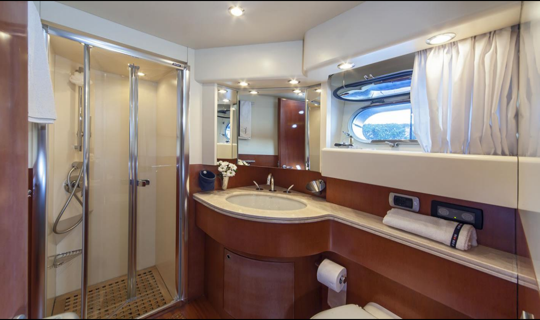
MASTER CABIN & VIP CABIN EN SUITE