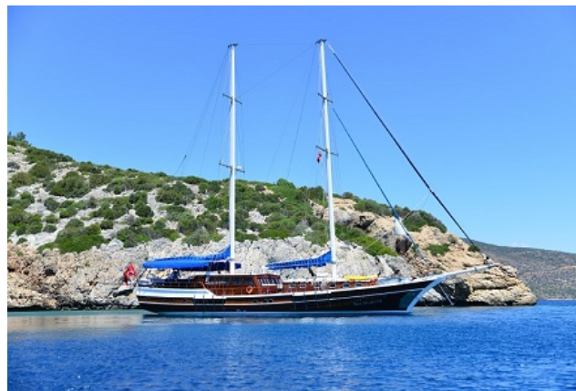
In a bay