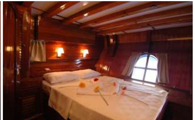
Aft double cabin