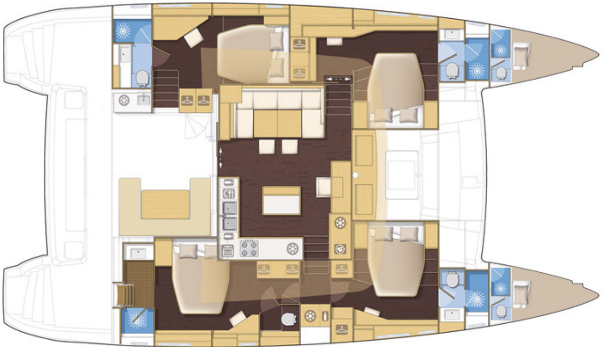
4 cabin version with central galley