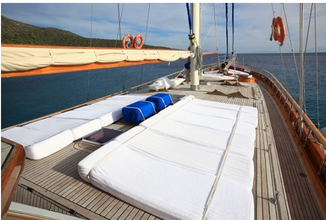
Foredeck sun cushions