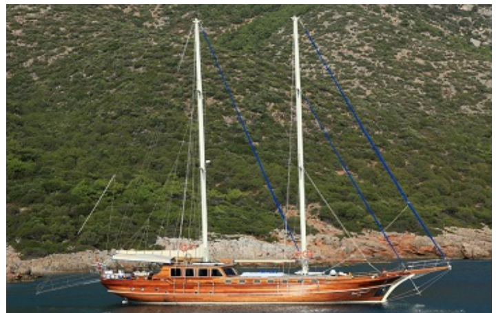
In a bay