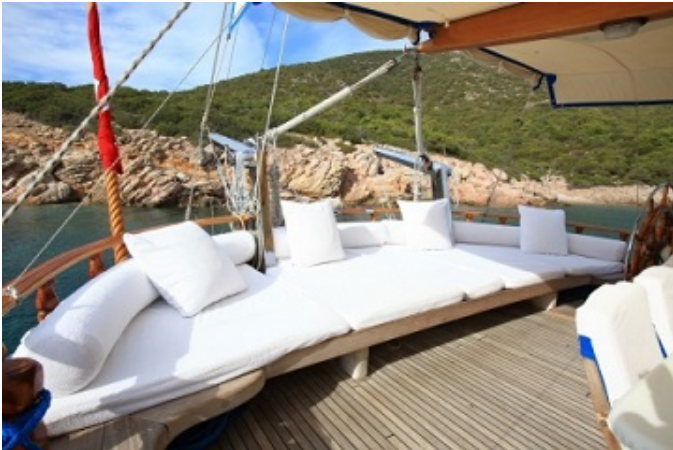
Aft deck cushions