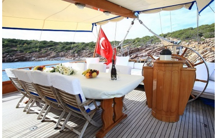
Aft deck dining area