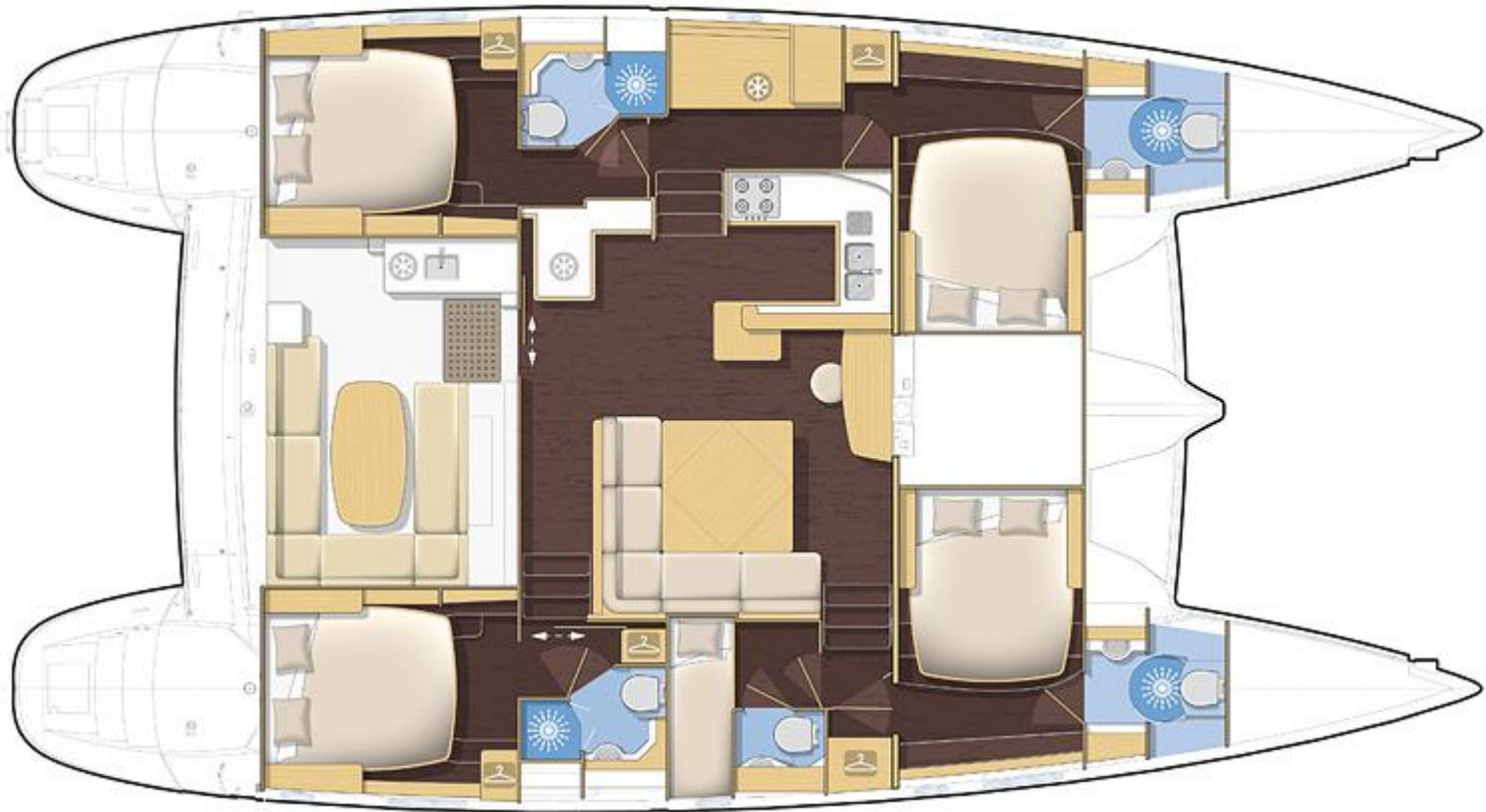
Version 5 cabines / 5 cabin version